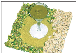
Pistachio Specialty Ingredients

Bedemco has launched three pistachio specialty ingredients that can be used for flavor enhancement in a wide variety of confectionery, dessert and ice cream applications: Pistachio Paste, Pistachio Praline Paste and Pistachio Praline Powder. All offer improvements in quality and manufacturing efficiencies. Pistachio Praline Powder in particular has advantages for new product development.