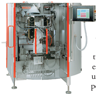
SVE 2510 DR

The SVE 2510 DR vertical form, fill and seal machine from Bosch offers production of a broad range of bag styles and high output. With standard bag forms, speeds up to 180 bags/min can be reached.